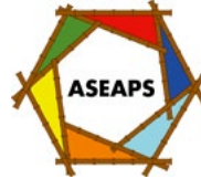
ASEAPS - Association of Southeast Asian Pain Societies